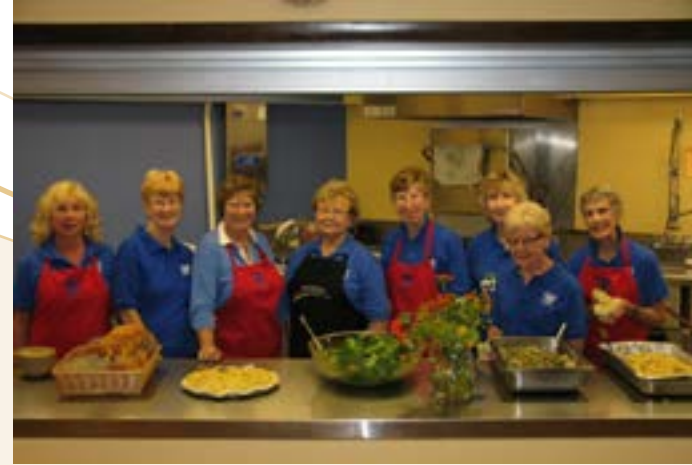
Attic Angel Volunteers serving at St. Mark's Meals for Madison