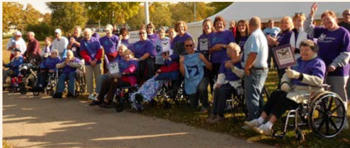
September 2012 Alzheimer's Walk - Attic Angel team