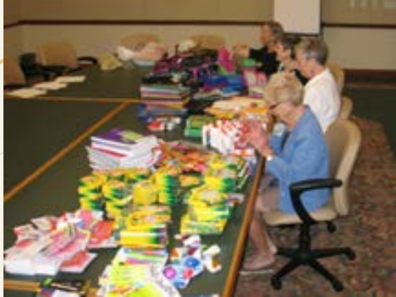
Attic Angel Volunteers tallying donations for the Falk School supply drive