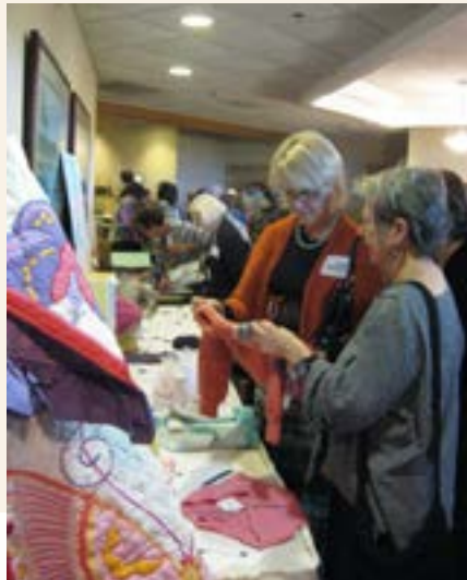
Silent Auction shopping