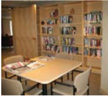
3rd floor HH Library

Many dreams and plans have come alive in the new addition at Attic Angel Place. We are deep into the final phases of "operationalizing" the new spaces - placing furniture and equipment, programming, staff and volunteers in all the right places, informing the community of our new units, and welcoming new residents.