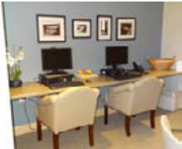
Computers in 3rd floor HH Library

The Capital Campaign for the Expansion Project has reached the $1.4 million mile marker! With just $100,000 to go, campaign committee members are gratified by the overwhelming, supportive response of donors in the Attic